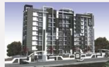
ARIHANT SAI RESIDENCY Jaisingh Pura, Ajmer Road, Jaipur