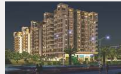
ARIHANT DYNASTY Ramsinghpura, Mansarovar, Jaipur