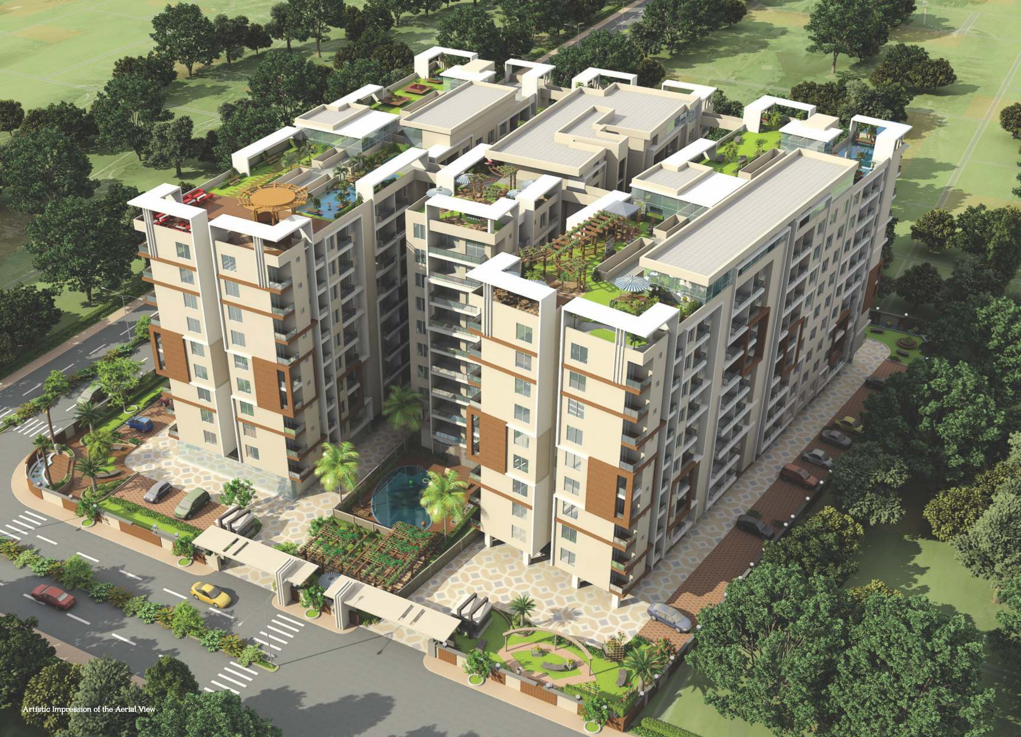
Artistic Impression of the Aerial View