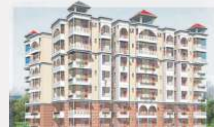
ARIHANT VEDANG HEIGHTS Opp. NRI Colony, Jagatpura, Jaipur