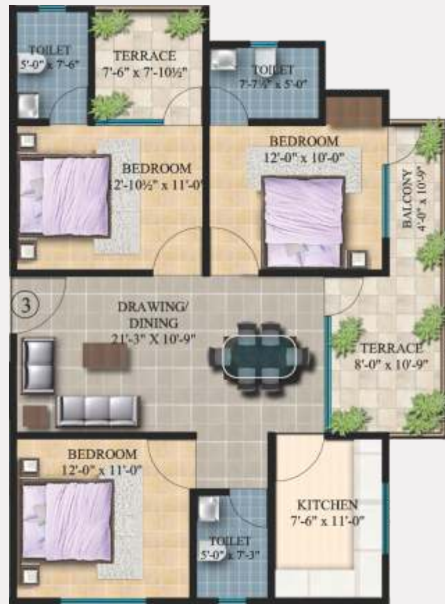
FLAT 03- 3 BHK S.B. U.A: 1350.0 sq.ft.