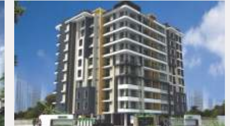
ARIHANT SHREE KRISHNAM HEIGHTS Opp. Chokhi Dhani, Jaipur