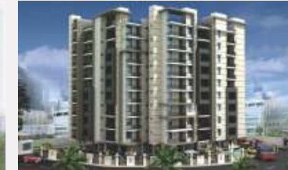
ARIHANT SHREE KRISHNAM RESIDENCY Dher Ke Balaji, Ambabari, Jaipur