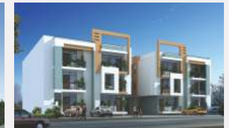
ARIHANT HOMES Nemi Nagar Extension, Vaishali Nagar, Jaipur