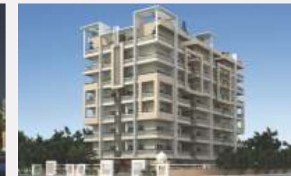
HALDIYA HEIGHTS Near Mahatma Gandhi Hospital, Jagatpura, Jaipur