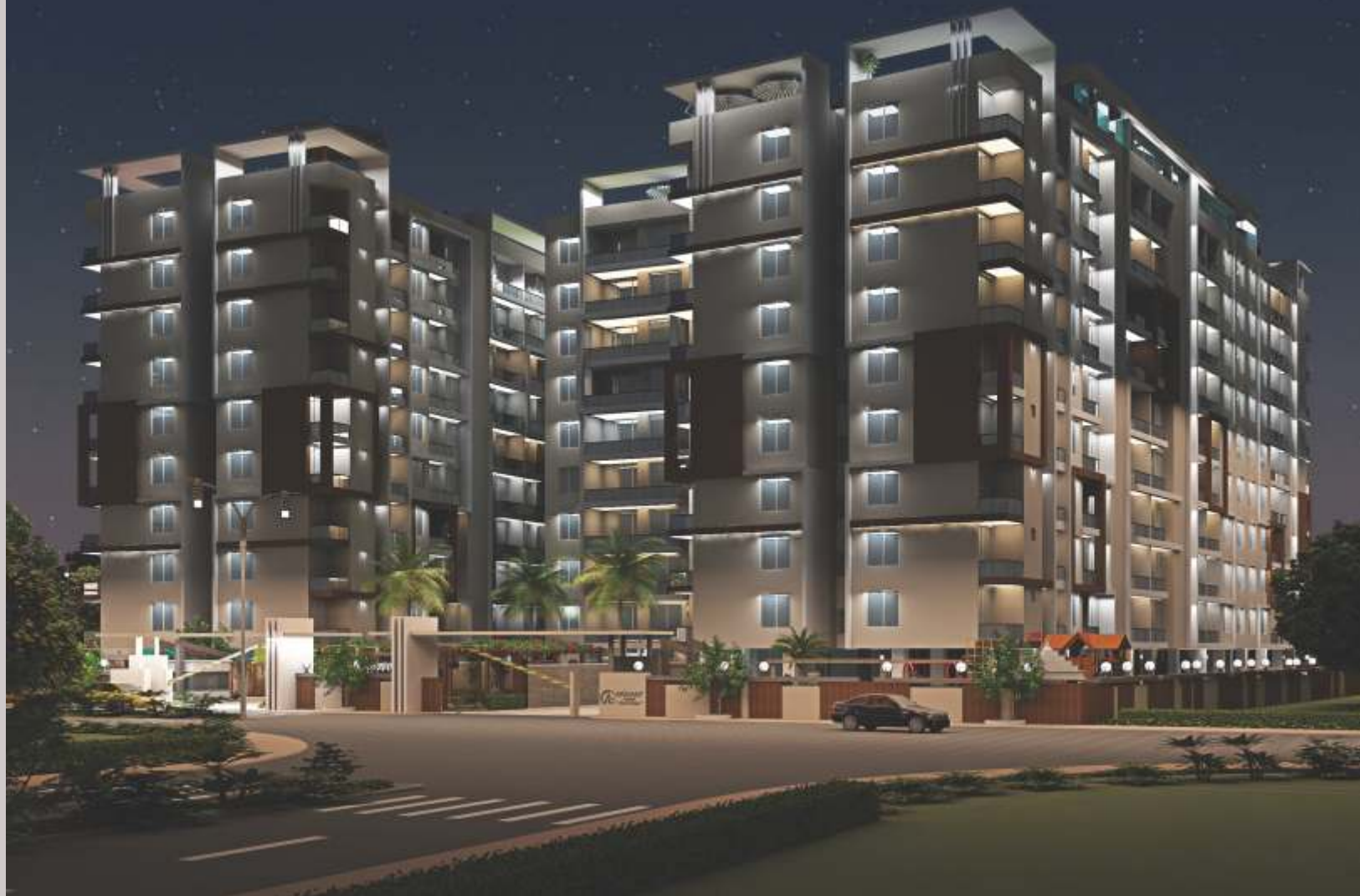
Artistic Impression of Night View