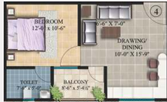
FLAT 04- 1 BHK S.B. U.A: 555.0 sq.ft.