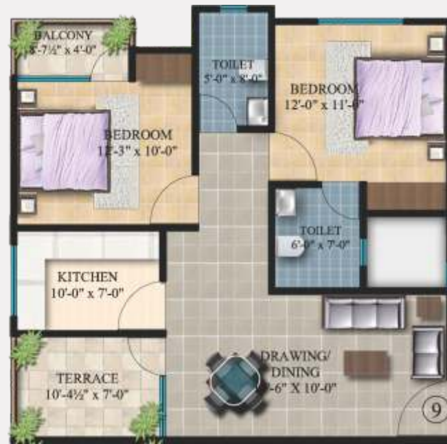
FLAT 09- 2 BHK S.B. U.A: 1050.0 sq.ft.